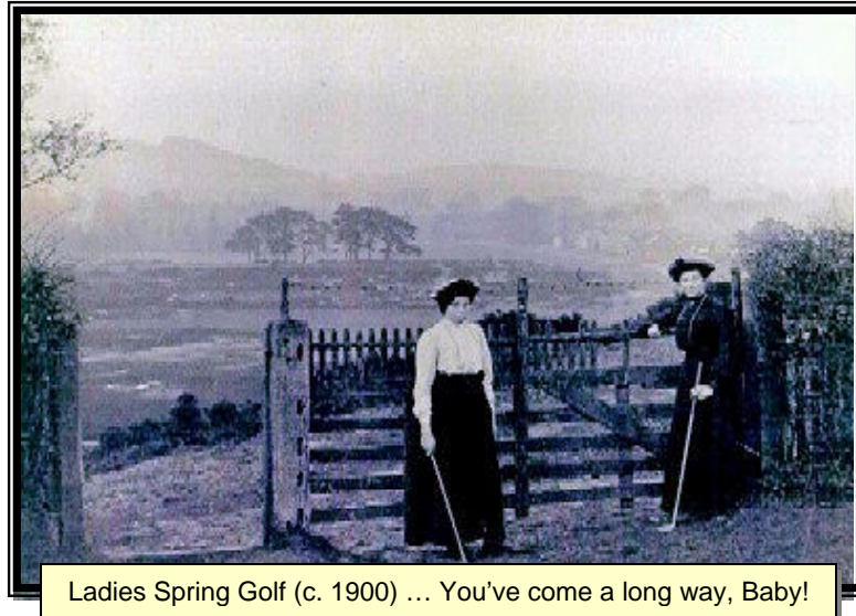
Ladies Spring Golf (c. 1900) ... You've come a long way, Baby!