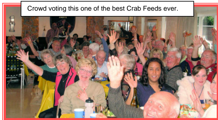
Crowd voting this one of the best Crab Feeds ever.