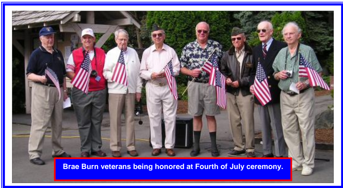
Brae Burn veterans being honored at Fourth of July ceremony.