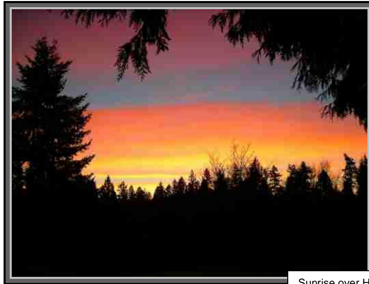
Sunrise over Hole #6.